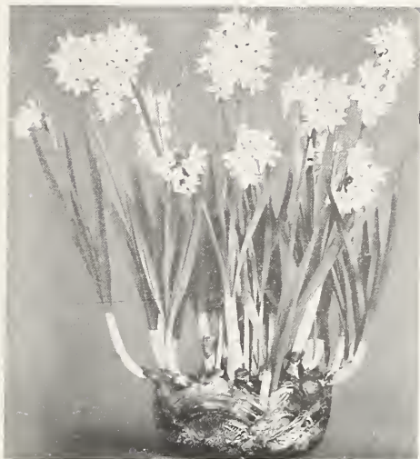
(Blooms in Water)

For indoors only. Will bloom in soil or water. Usually put in dish or bowl with small stones and water, treated same as the well known Chinese lily. Is now used in place of Chinese lily by many, as it is more certain to bloom. Use good strong bulbs. The small cheap bulbs often have no flower stem and will not bloom. I handle the best quality only.